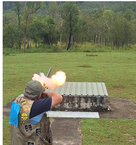
As you can see, Muzzleloading makes for an exciting spectator event.