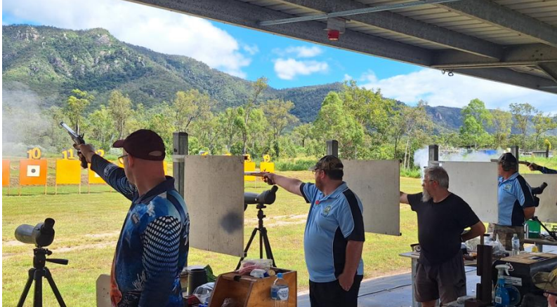
Twenty-five shooters from four states attended a hotly contested Muzzleloading National Championships in Townsville.

The 2025 Nationals kicked off on Friday, 18 April 2025, with the thunderous firing of a