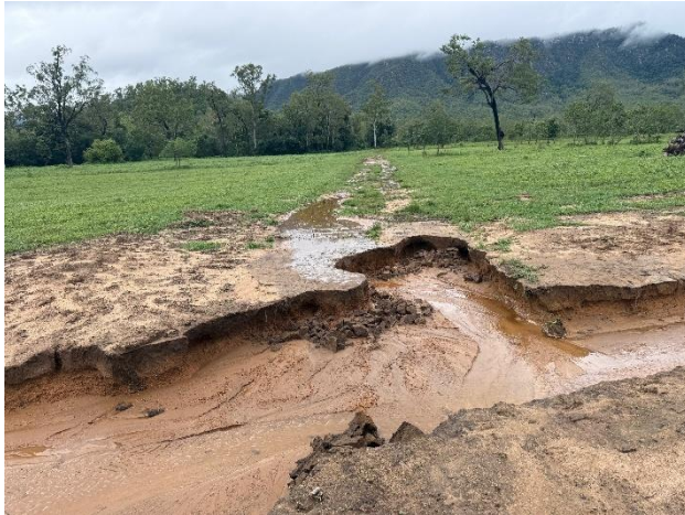
The floods eroded soil from the North Queensland ranges requiring expensive earth work remediation.

Record-breaking floods in Queensland have caused tens of thousands of dollars in damages to clubs, ranges and roads, knocked out or forced committees to reschedule shoots and competitions and now are giving rise to a rare tropical disease: melioidosis.